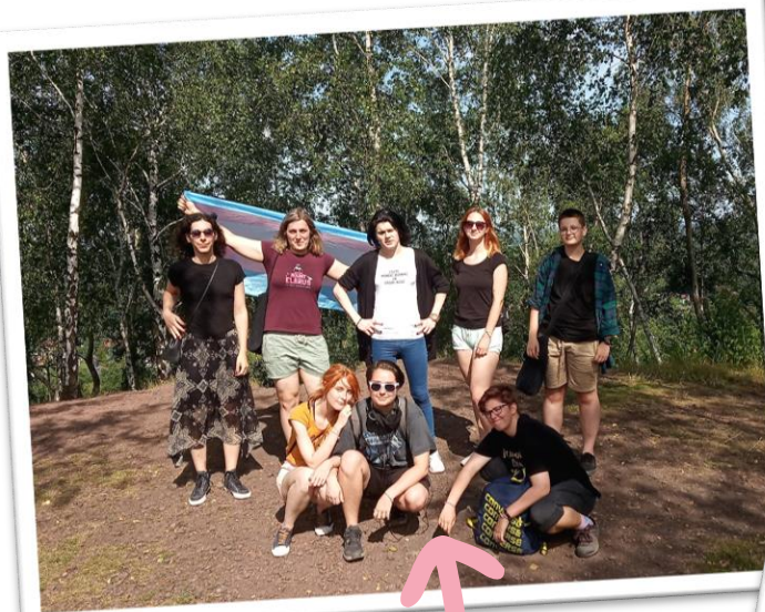
TRIP ON EMA, OSTRAVA