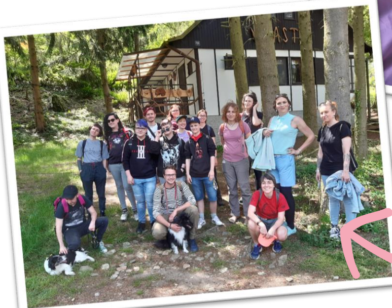
FIRST TRIP OF 2020, POSÁZAVÍ