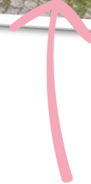
MEETING IN OLOMOUC